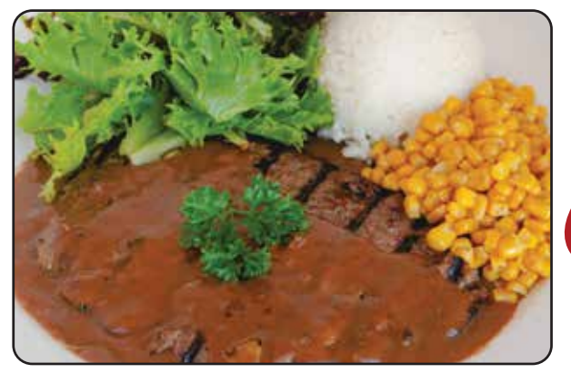
Served with our famous butter roll, rice, corn, and your choice of mixed greens or potato-mac salad Substitute with Fried Rice 1.75