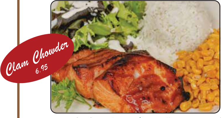
Served with our famous butter roll , rice, corn, and your choice of mixed greens or potato-mac salad