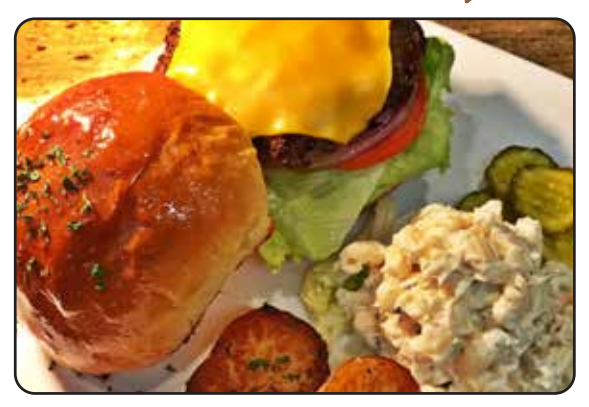
Ground Chuck hamburger patty served on a fresh baked bun with our famous fried potatoes, lettuce, tomato, onions, pickles, and mixed greens.