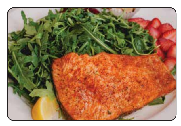
Served with our famous butter roll