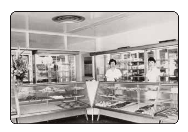
Some things never change.... And at Liliha Bakery, that's a good thing!