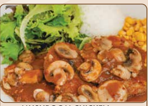
MUSHROOM CHICKEN 19.50 Served with our famous butter roll, rice, corn, and your choice of salad