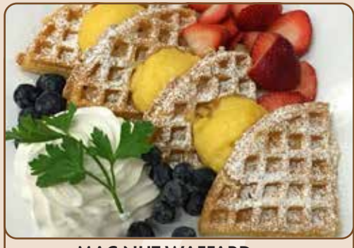
MAC NUT WAFFARD 17.95 Waffle, custard, and fresh fruits