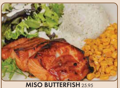
Served with our famous butter roll, rice, corn, and your choice of salad