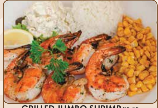
GRILLED JUMBO SHRIMP 20.50 Served with our famous butter roll , rice, corn, and your choice of salad