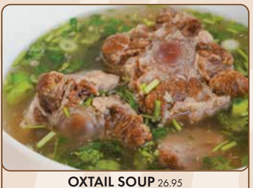
Add Saimin 1.50