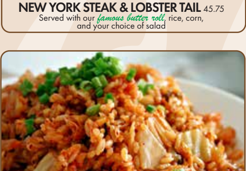
KIM CHEE FRIED RICE & EGGS 19.50 Served with your choice of ham, bacon, pork sausage, portuguese sausage, spam or vienna sausage. Add 2 slices of cheese 0.89