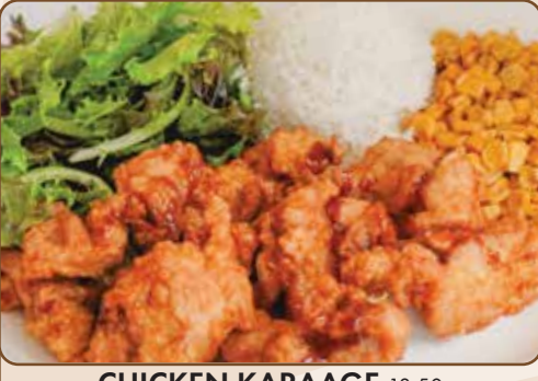
CHICKEN KARAAGE 18.50 Topped w/ remoulade & teriyaki sauce and served with our famous butter roll, rice, corn, and your choice of salad