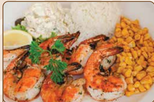
GRILLED JUMBO SHRIMP 20.50 Served with our famous butter roll , rice, corn, and your choice of salad