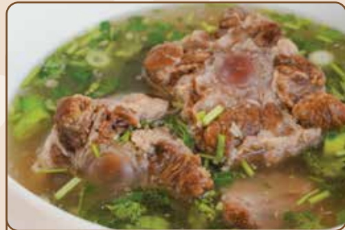
OXTAIL SOUP 26.95 Add Saimin 1.50