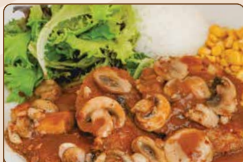
MUSHROOM CHICKEN 19.50 Served with our famous butter roll , rice, corn, and your choice of salad