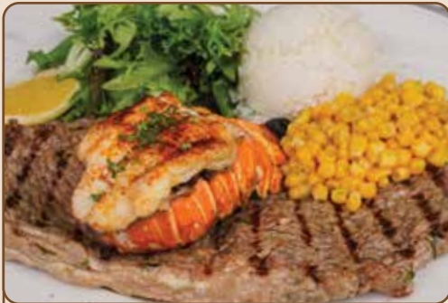
NEW YORK STEAK & LOBSTER TAIL 45.75 Served with our famous butter roll , rice, corn, and your choice of salad