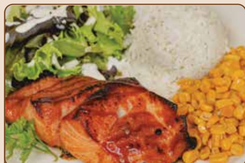
MISO BUTTERFISH 25.95 Served with our famous butter roll , rice, corn, and your choice of salad