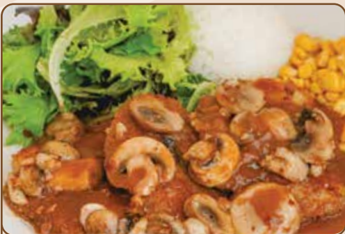
MUSHROOM CHICKEN 17.95 Served with our famous butter roll , rice, corn, and your choice of salad