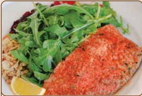
ARUGULA SALAD w/ grilled salmon 19.50