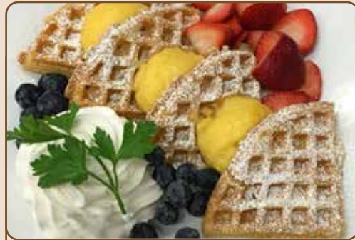
WAFFARD 14.95 Waffle, custard, and fresh fruits