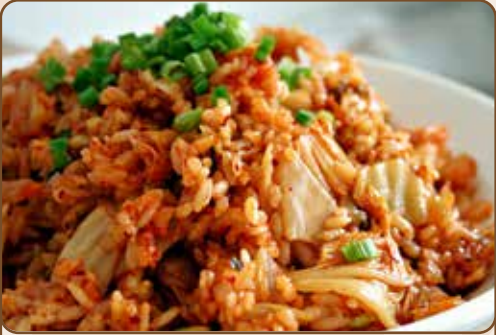
KIM CHEE FRIED RICE 18.95 Served with your choice of ham, bacon, pork sausage, portuguese sausage, spam or vienna sausage. Add 2 slices of cheese 0.89