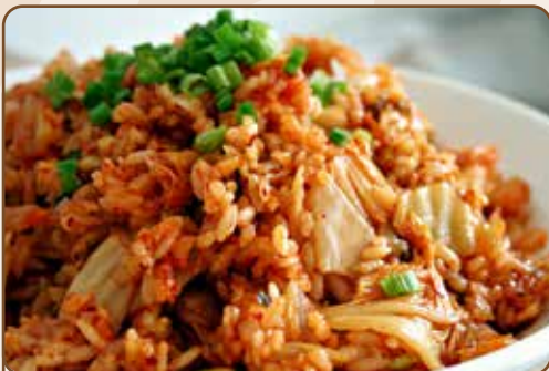
KIM CHEE FRIED RICE 18.95 Served with your choice of ham, bacon, pork sausage, portuguese sausage, spam or vienna sausage. Add 2 slices of cheese 0.89