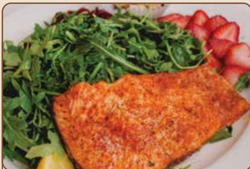
ARUGULA SALAD w/ grilled salmon 20.95