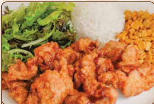
CHICKEN KARAAGE 17.95 Topped w/ remoulade & teriyaki sauce and served with our famous butter roll , rice, corn, and your choice of salad