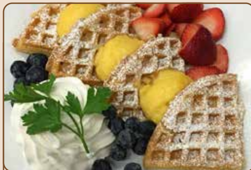
WAFFARD 16.95 Waffle, custard, and fresh fruits