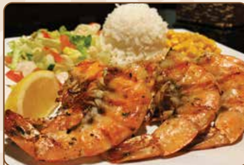
GRILLED JUMBO SHRIMP 19.50 Served with our famous butter roll , rice, corn, and your choice of salad