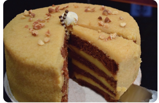
CAKE OF THE DAY (1/5 slice) 5.95