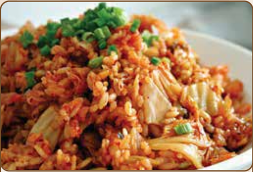
KIM CHEE FRIED RICE 18.95 Served with your choice of ham, bacon, pork sausage, portuguese sausage, spam or vienna sausage. Add 2 slices of cheese 0.89