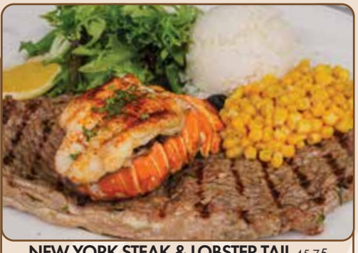
NEW YORK STEAK & LOBSTER TAIL 45.75 Served with our famous butter roll , rice, corn, and your choice of salad