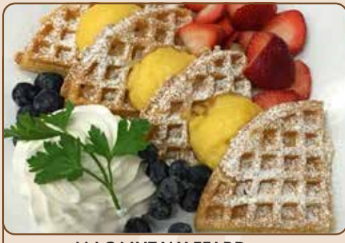
MAC NUT WAFFARD 17.95 Waffle, custard, and fresh fruits