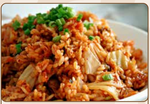
KIM CHEE FRIED RICE & EGGS 19.50 Served with your choice of ham, bacon, pork sausage, portuguese sausage, spam or vienna sausage. Add 2 slices of cheese 0.89