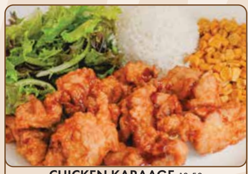
CHICKEN KARAAGE 18.50 Topped w/ remoulade & teriyaki sauce and served with our famous butter roll, rice, corn, and your choice of salad