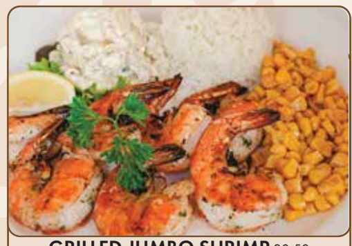
GRILLED JUMBO SHRIMP 20.50 Served with our famous butter roll, rice, corn, and your choice of salad