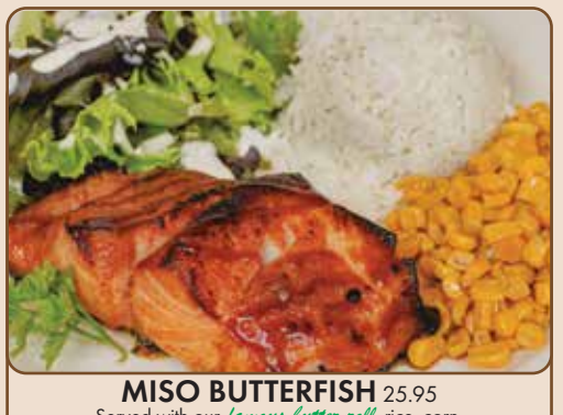
Served with our famous butter roll , rice, corn, and your choice of salad