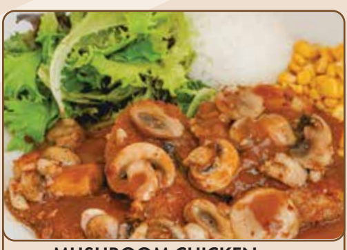
MUSHROOM CHICKEN 19.50 Served with our famous butter roll , rice, corn, and your choice of salad