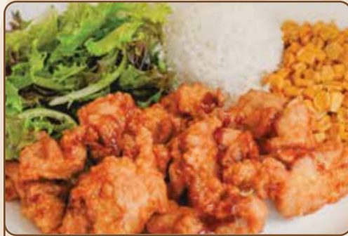
CHICKEN KARAAGE 18.50 Topped w/ remoulade & teriyaki sauce and served with our famous butter roll , rice, corn, and your choice of salad