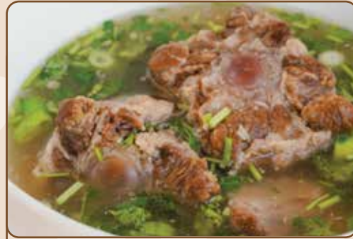
OXTAIL SOUP 26.95 Add Saimin 1.50