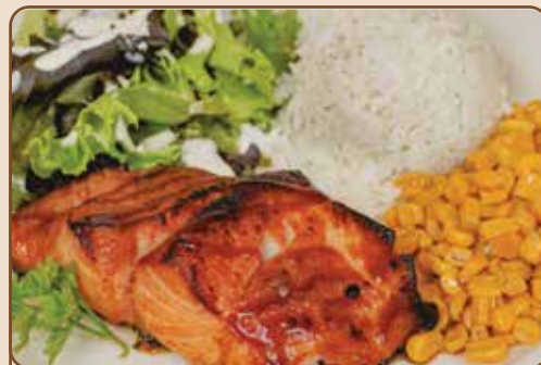
MISO BUTTERFISH 25.95 Served with our famous butter roll , rice, corn, and your choice of salad