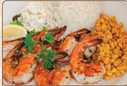
GRILLED JUMBO SHRIMP 20.50 Served with our famous butter roll , rice, corn, and your choice of salad