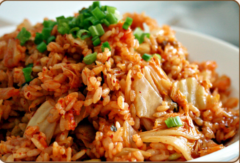
KIM CHEE FRIED RICE & EGGS 19.50 Served with your choice of ham, bacon, pork sausage, portuguese sausage, spam or vienna sausage. Add 2 slices of cheese 0.89