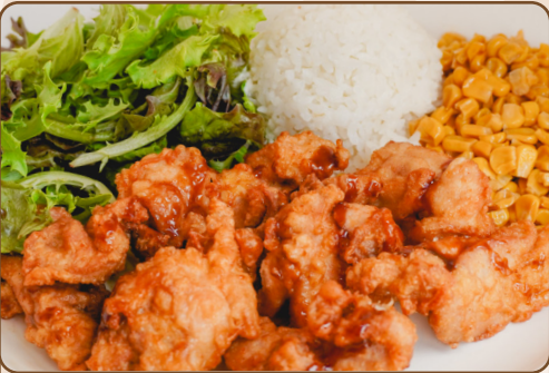
CHICKEN KARAAGE 18.50 Topped w/ remoulade & teriyaki sauce and served with our famous butter roll , rice, corn, and your choice of salad