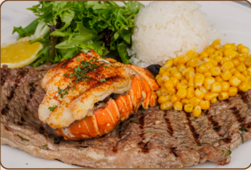
NEW YORK STEAK & LOBSTER TAIL 45.75 Served with our famous butter roll , rice, corn, and your choice of salad