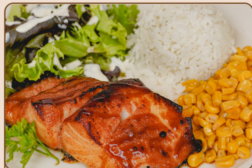
MISO BUTTERFISH 25.95 Served with our famous butter roll , rice, corn, and your choice of salad