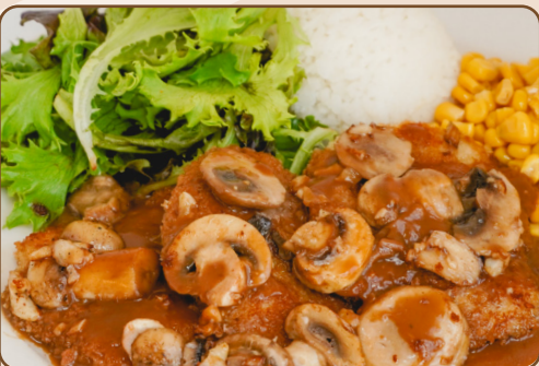
MUSHROOM CHICKEN 19.50 Served with our famous butter roll , rice, corn, and your choice of salad