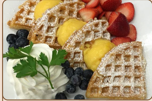
MAC NUT WAFFARD 17.95 Waffle, custard, and fresh fruits