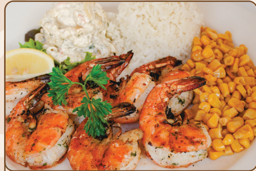
GRILLED JUMBO SHRIMP 20.50 Served with our famous butter roll , rice, corn, and your choice of salad