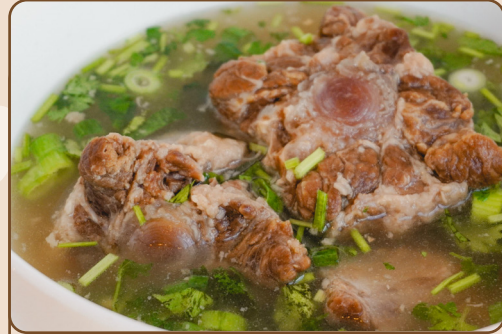
OXTAIL SOUP 26.95 Add Saimin 1.50