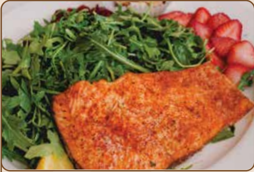
ARUGULA SALAD w/ grilled salmon 19.95