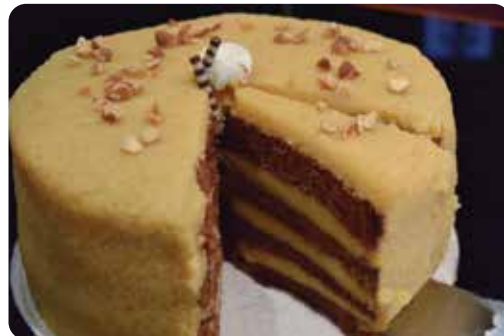
CAKE OF THE DAY (1/5 slice) 6.95